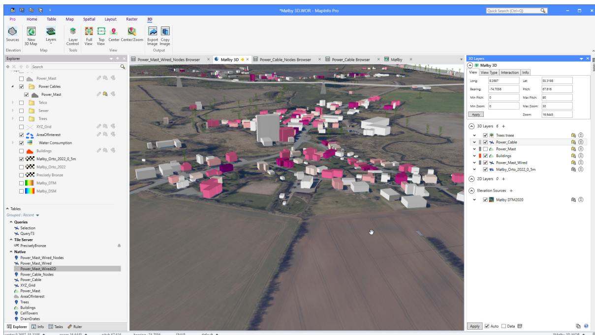
MapInfo Pro helps you explore, model, and act upon locations throughout the world.

Build models that are easily understood. Enable corporate decision-makers to understand each site and scenario's attributes and drawbacks fully. Help them take the type of action that propels your business forward.