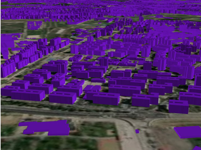
MapInfo Pro powers better decision-making with a cutting-edge 3D view.

We live in a 3D world, so visualizing three-dimensional spatial data provides a more comprehensive and realistic representation of terrain, buildings, and objects. With MapInfo Pro, you can visualize your 3D data and power better decision-making without additional tools or extensions.